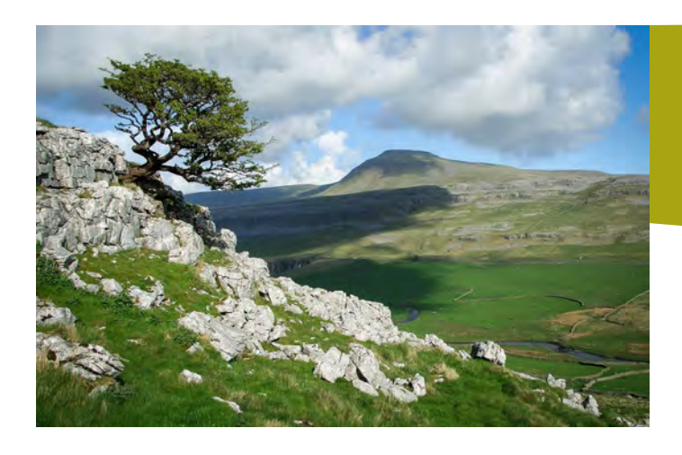
Yorkshire dales National Park, Craven District

The Annual Report of the North Yorkshire Branch of the Campaign to Protect Rural England 2014