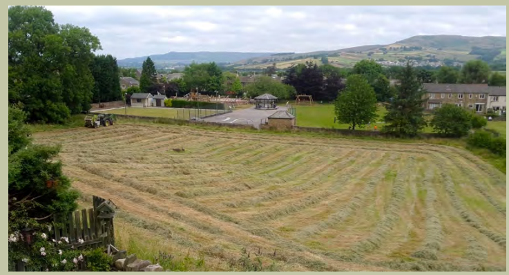
'Madge Bank' Cononley saved 2015