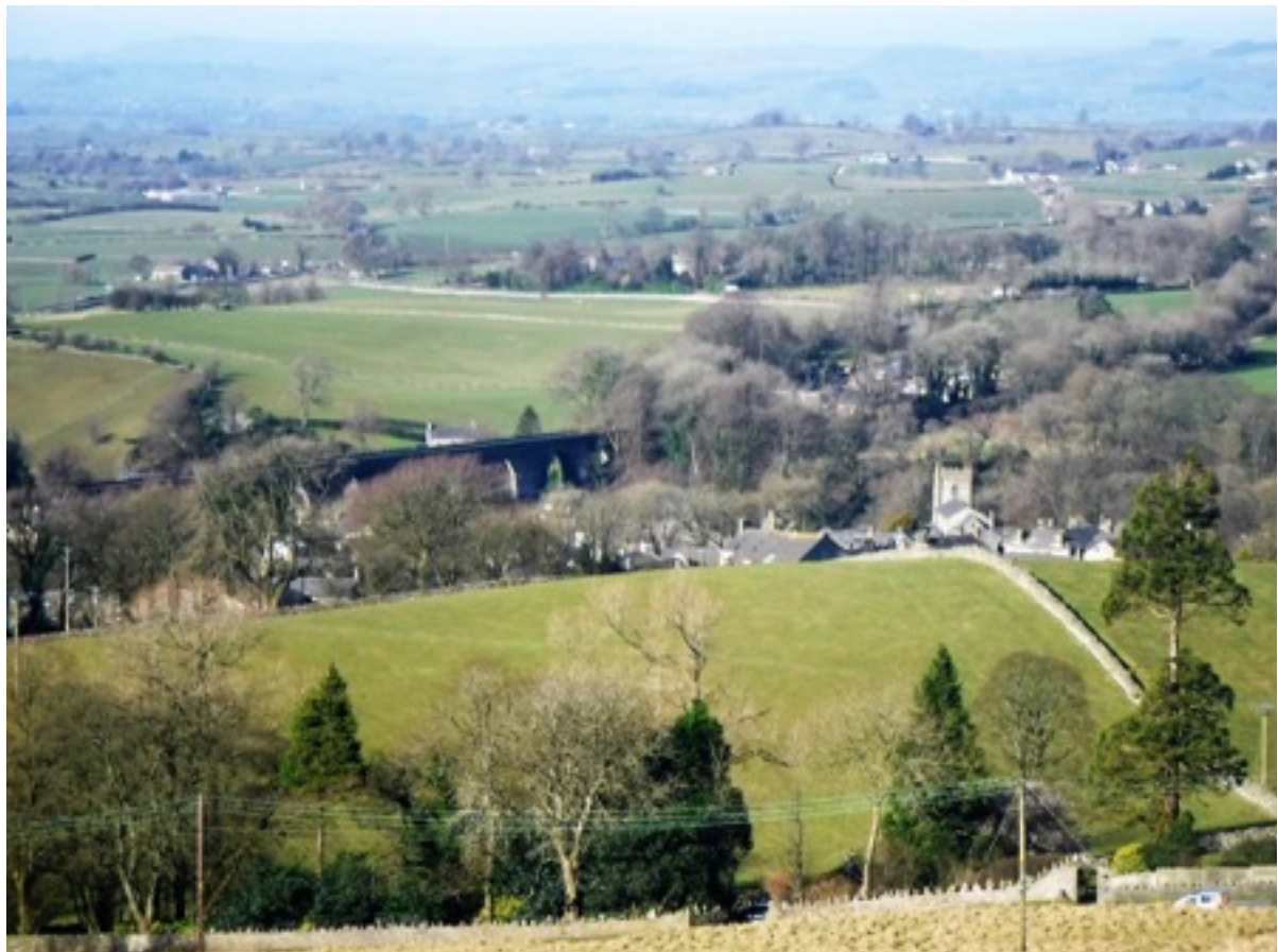
Image illustrates the rural setting of Ingleton

CPRE welcome the inclusion of the need for assessment in bullet point b) regarding impacts on the character and appearance of the surrounding area and also bullet point c) which directly relates to the need to avoid harm to sensitive areas, buildings/ structures and accords with Local Plan policies ENV1, ENV2 and ENV4.