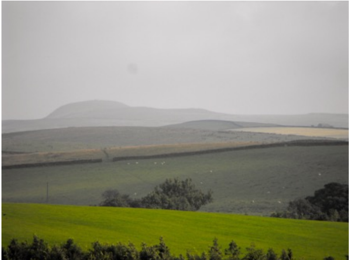
National Park in the far ground, Craven District landscape out-with YDNP foreground

Approved by Craven Spatial Planning Sub- Committee 4th April 2016