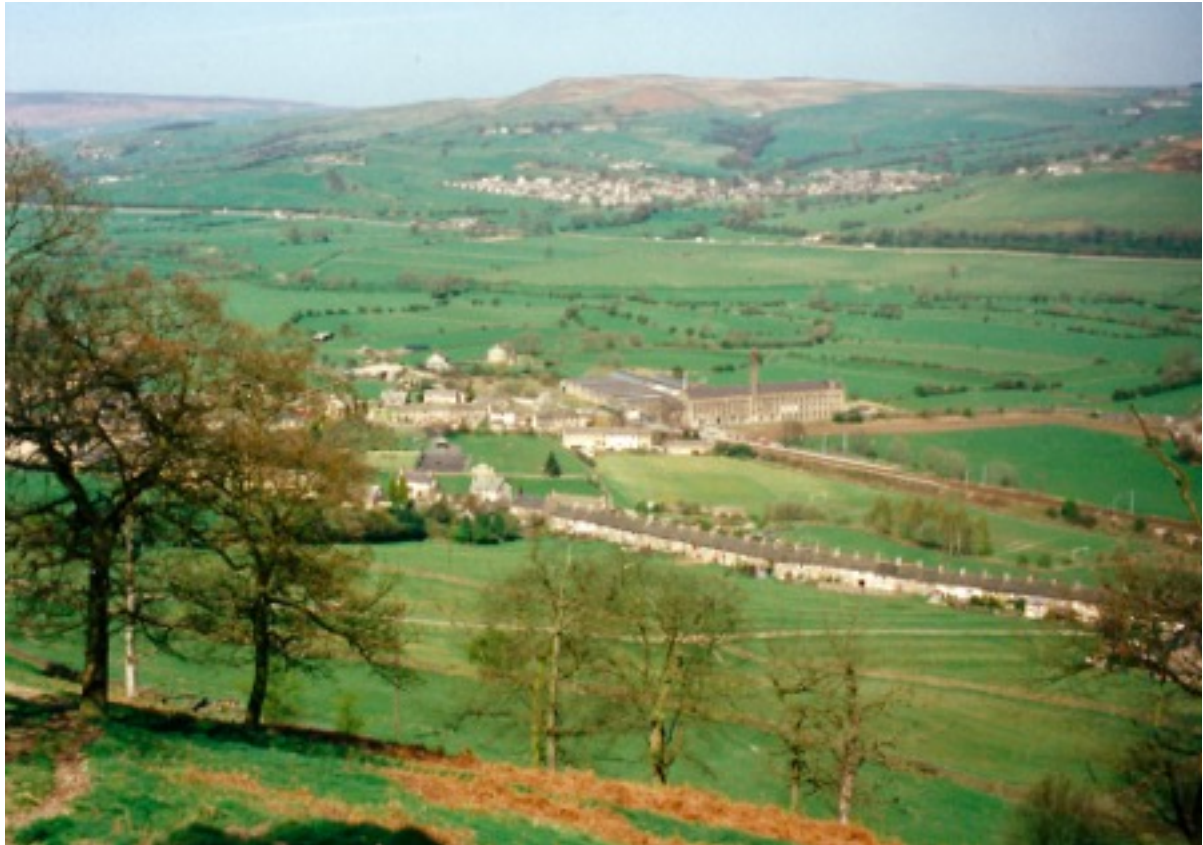
image showing Cononley village and the mill site CN009

There will be no garages for the housing units to save space and reduce cost