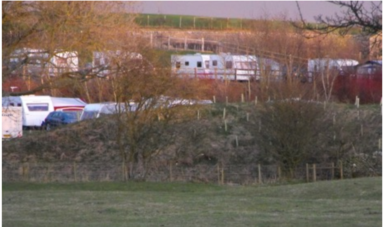
image illustrates lack of screening for 12 months of the year at Gallaber Park ( a large trailer park in Hellifield - deciduous trees, poorly maintained fail to screen when the leaves drop. Image illustrates impact on the Long Preston Conservation area (foreground)

tourist accommodation providers to be developed in rural areas. There is a need to ensure existing sites are improved where possible and where appropriate expand where they are well screened and restricted to short stay holiday occupancy only.