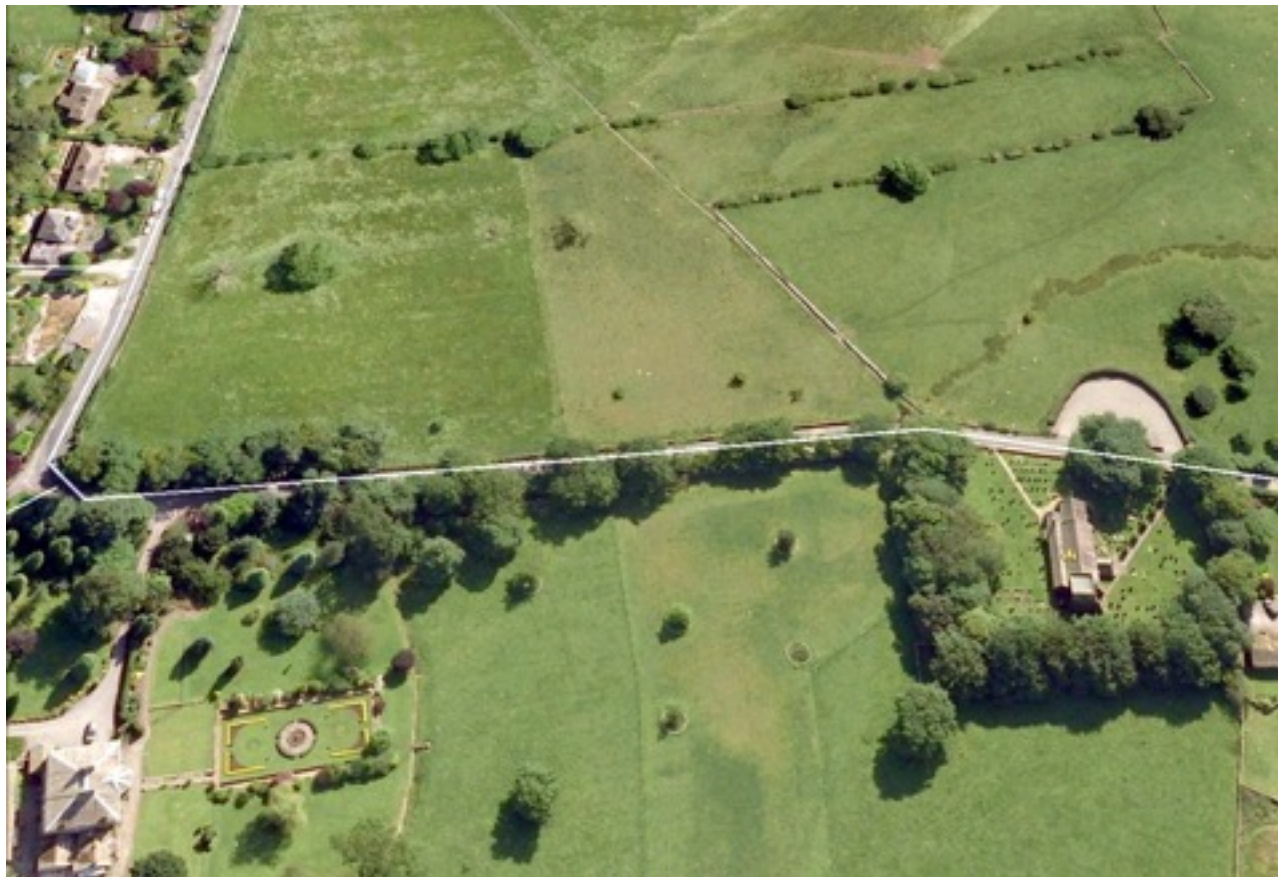
image illustrates current landscape and heritage assets. the road marks the boundary of the Yorkshire Dales National Park

The area EM012 (EM010) is we believe the subject of a Local Green Space Designation application. This we believe, in view of the quality, setting and location of the landscape in question should be endorsed and supported by CPRE. The level of objections to application 14881 illustrates the importance of this area to local people.