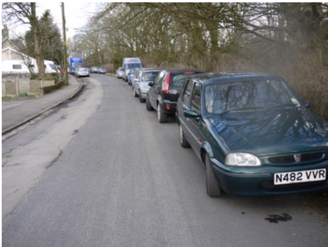
Image illustrates Parking adjacent to the site looking toward Hellifield railway station

Stage 6 (Pass): Residential development can make a very good contribution to improving the appearance of this prominent site near to the rail station. Small part of the site to the north within the Settle-Carlisle Railway Conservation Area. Station Road servicing the site is currently a private road, and a change to public ownership would be necessary. The quality of this service road can be improved. The map of options map fails to illustrate road capacity/access issues have been identified.