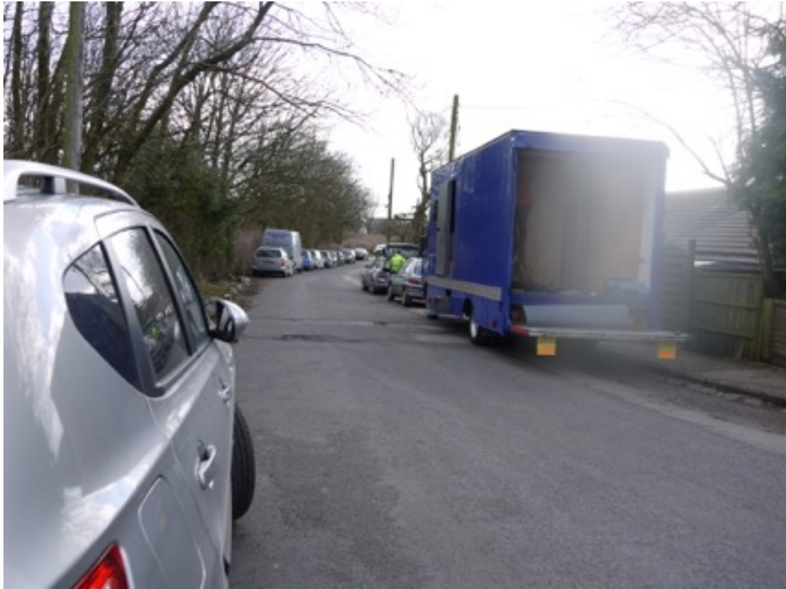
Image illustrates parking adjacent and opposite the site looking down from Hellifield railway station

CPRE comments from response to SHLAA 2013 still apply: